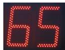
Digit with 250 mm figure height